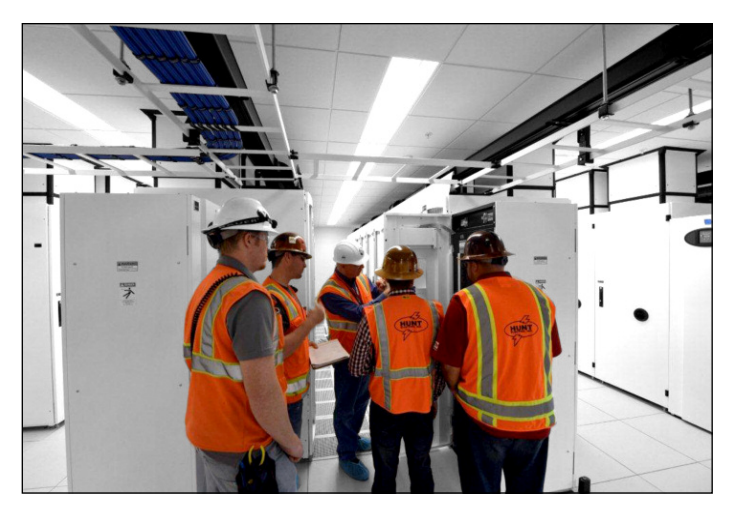
Hunt Electric's I.T.S./Data Communications Team works to layout CPI cabinets in Nu Skin's data center.

Additionally, they compared airflow abilities of CPI's N-Series and F-Series TeraFrame Cabinets, both of which feature CPI Passive Cooling® Solutions. The N-Series is optimized for side-breathing equipment, while the F-Series manages traditional front-to-back airflow.