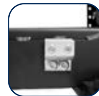
Two Mounting Hole Ground Terminal Block