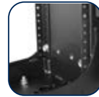
Adjustable Depth Mounting Rails